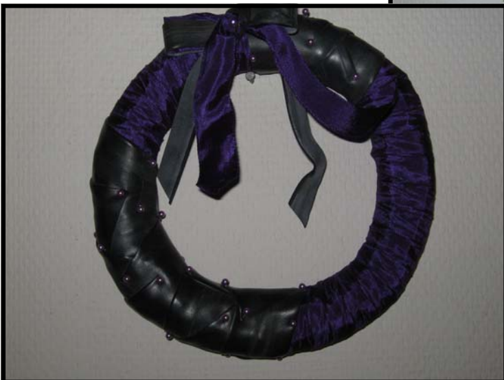
Cykelslange og silkebånd